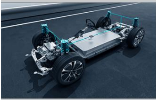
Disus-C Intelligent electrically controlled active suspension