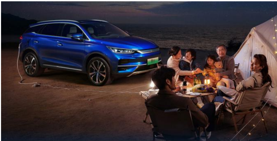
VTOL mobile power station