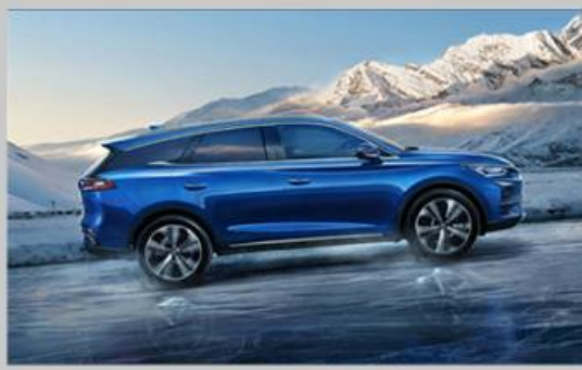
Super smart electric all-wheel-drive