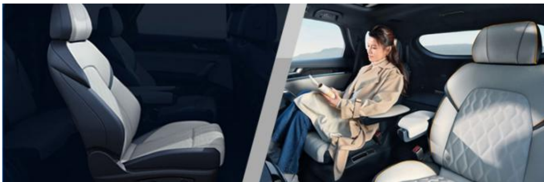
▲ Two separate electric seats